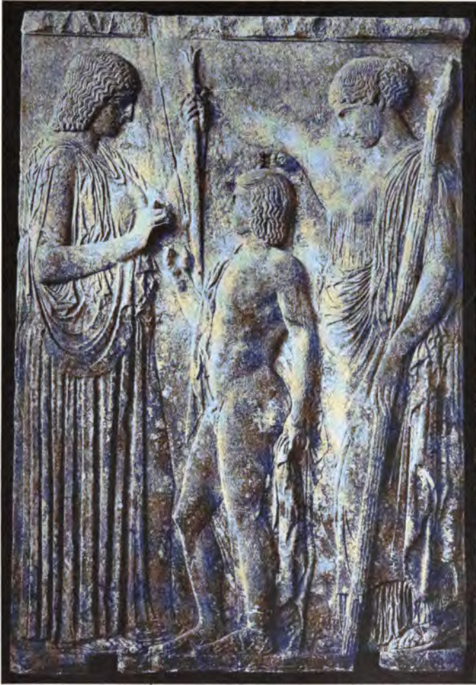
Fig. 44. Demeter, Triptolemus and Persephone.